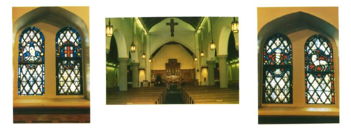
After its dedication in 1926, Mr. Louis C. Carvello, Portuguese Consul in New Orleans, visited Sacred Heart Church. Upon seeing our beautiful church he stated "Sacred Heart Church is a perfect reproduction of a twelfth century Catholic Church, even the crucifix being a perfect example".

Some examples of pointed arches throughout the church include some of the exterior wooden doors, the clerestory, and nave stained glass windows, the exterior bell enclosure, the interior vaulted ceiling, the great triumphant arch leading to the altar, and the arched wooden panel design of the door leading to the sacristy.