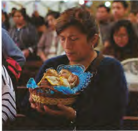
A woman holds a figurine of the Christ Child during Mass on the feast of the Epiphany.

Epiphany, on the other hand, is made for celebration, gift-giving, going all out. Perhaps someday we can return to the traditions of Epiphany and restore Christmas as a day of rejoicing and worship.