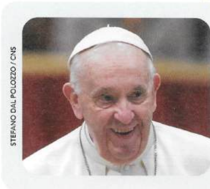
STEFANO DAL POLOZZO / CNS