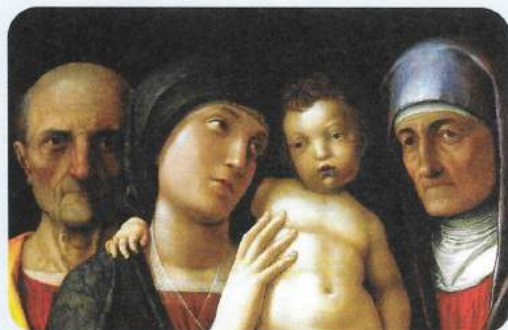
HOLY FAMILY WITH SAINTS ANNE AND JOHN THE BAPTIST (DETAIL), ANDREA MANTEGNA