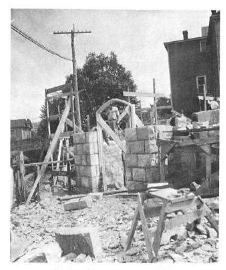
Laying the cornerstone, 1924